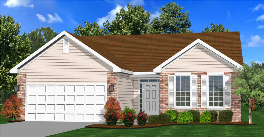
Plans and elevations are artist's conceptions. Refer to plans and specifications in the Sales Office for current details.