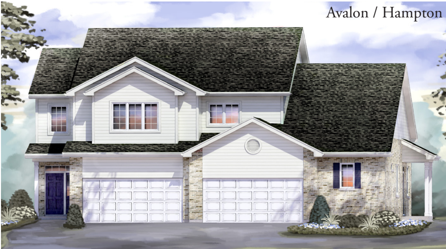
Avalon / Hampton