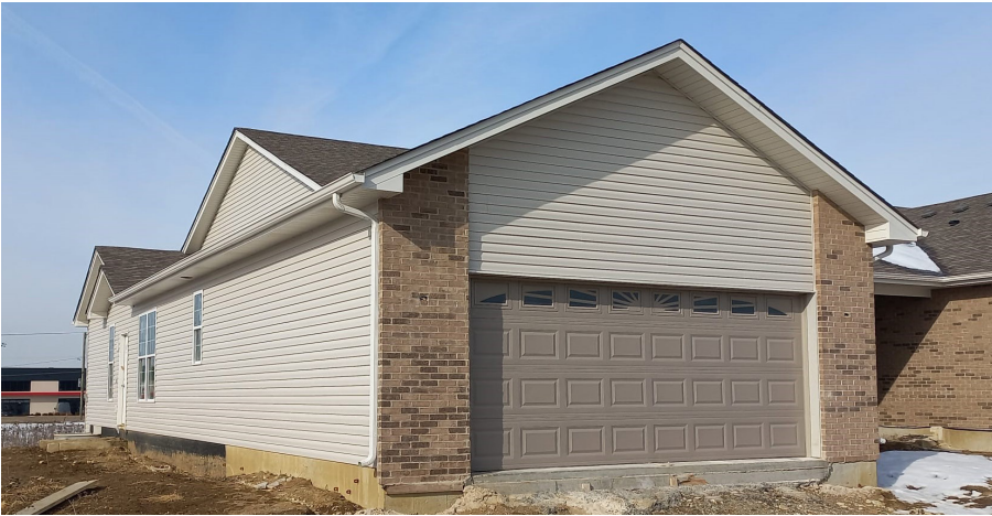
Plans and elevations are artist's conceptions. Refer to plans and specifications in the Sales Office for current details.