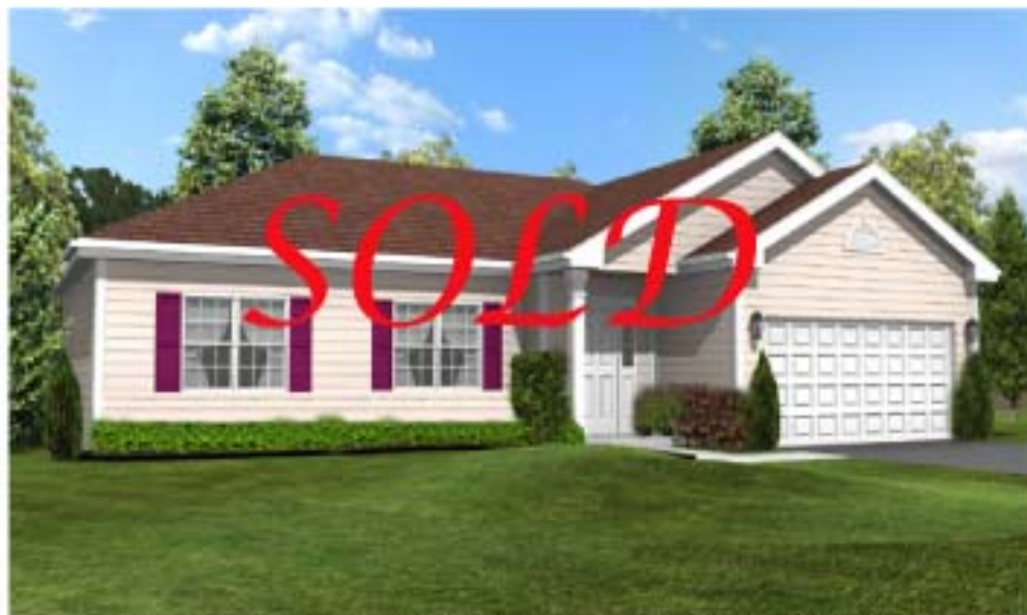
Illustration is artists' rendering and subject to change.